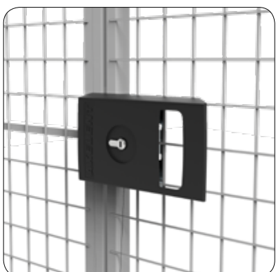
Cylinderlock - For even more secure storage.