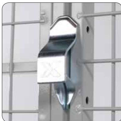
Padlock cover (for FK och FK+) - Can be used on all doors to protect the padlock. Also available with extra reinforced fitting. (see left picture)