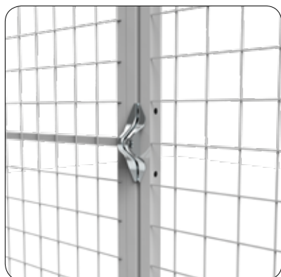
Padlock cover (for F-system) - Can be used on all doors to protect the padlock.